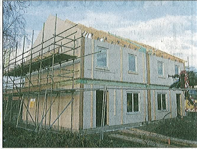
HERE WE GO: Saffron Housing start work on building an eco-home in Skelton Road in the morning, above, and by nightfall, top right, it is nearly finished. 9DE0304008 & 024.